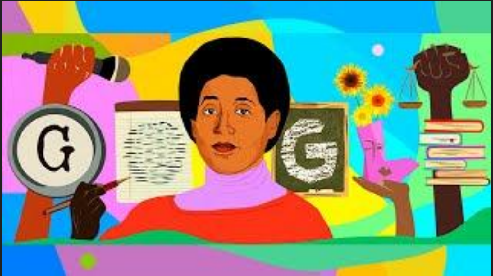
Behind the Doodle: Audre Lorde's 87th Birthday